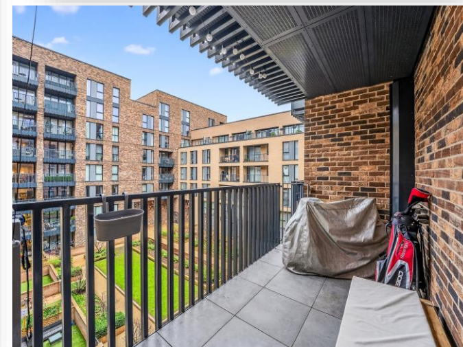
Mauger Heights, Summerstown, London SW17 0GZ