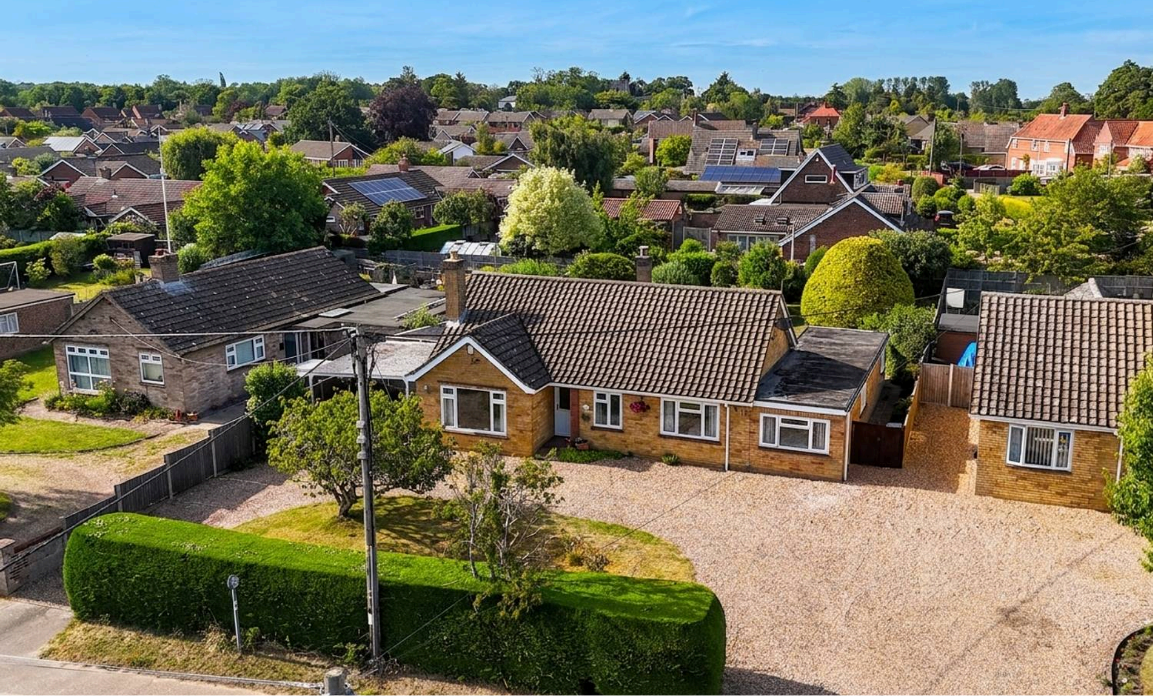
Wheel Road, Alpington - NR14 7NH