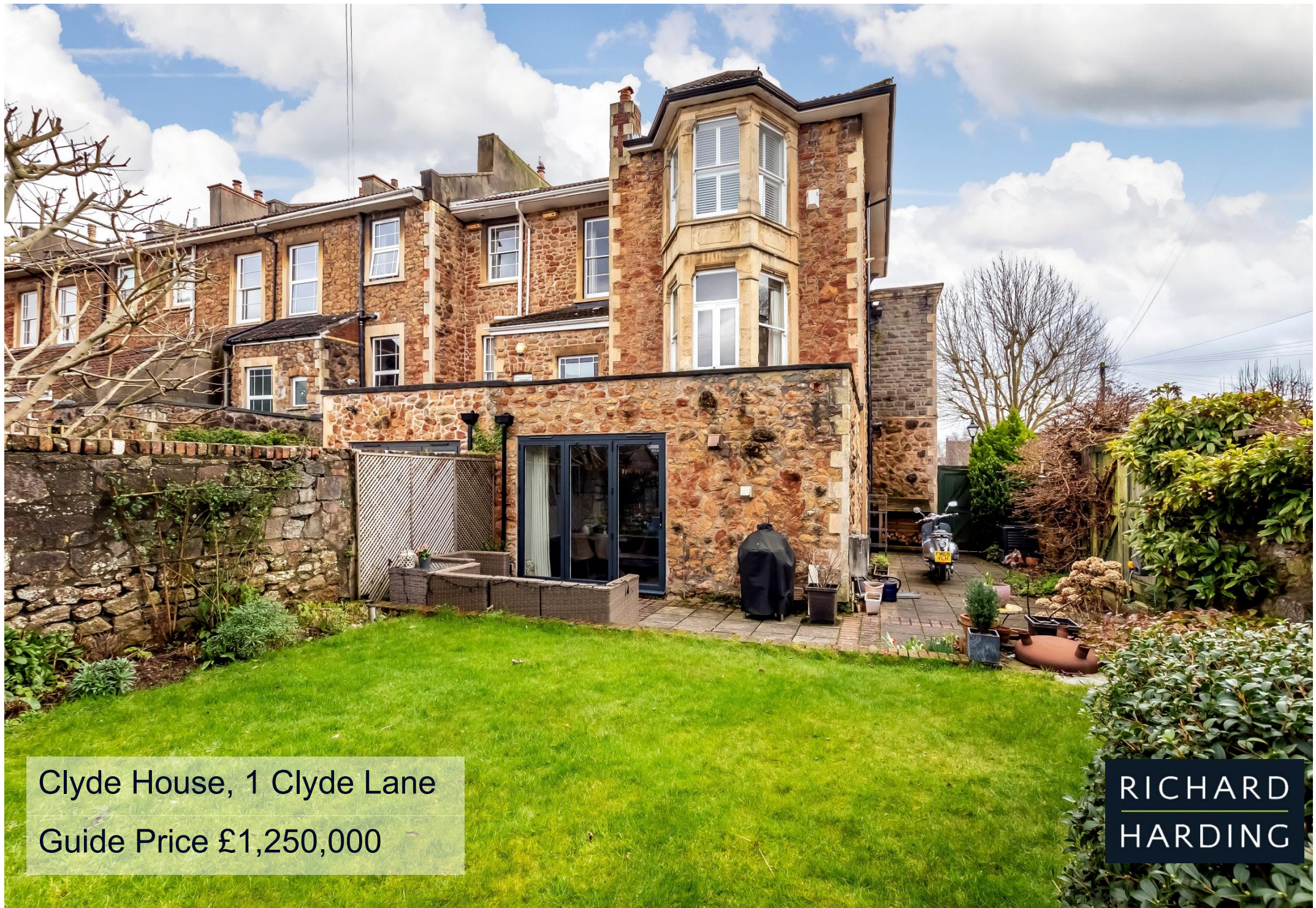
Clyde House, 1 Clyde Lane Guide Price £1,250,000