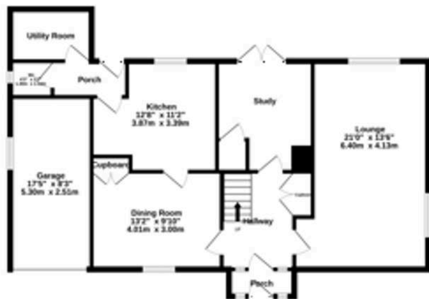
Ground Floor 943 sq.ft. (87.6 sq.m.) approx.