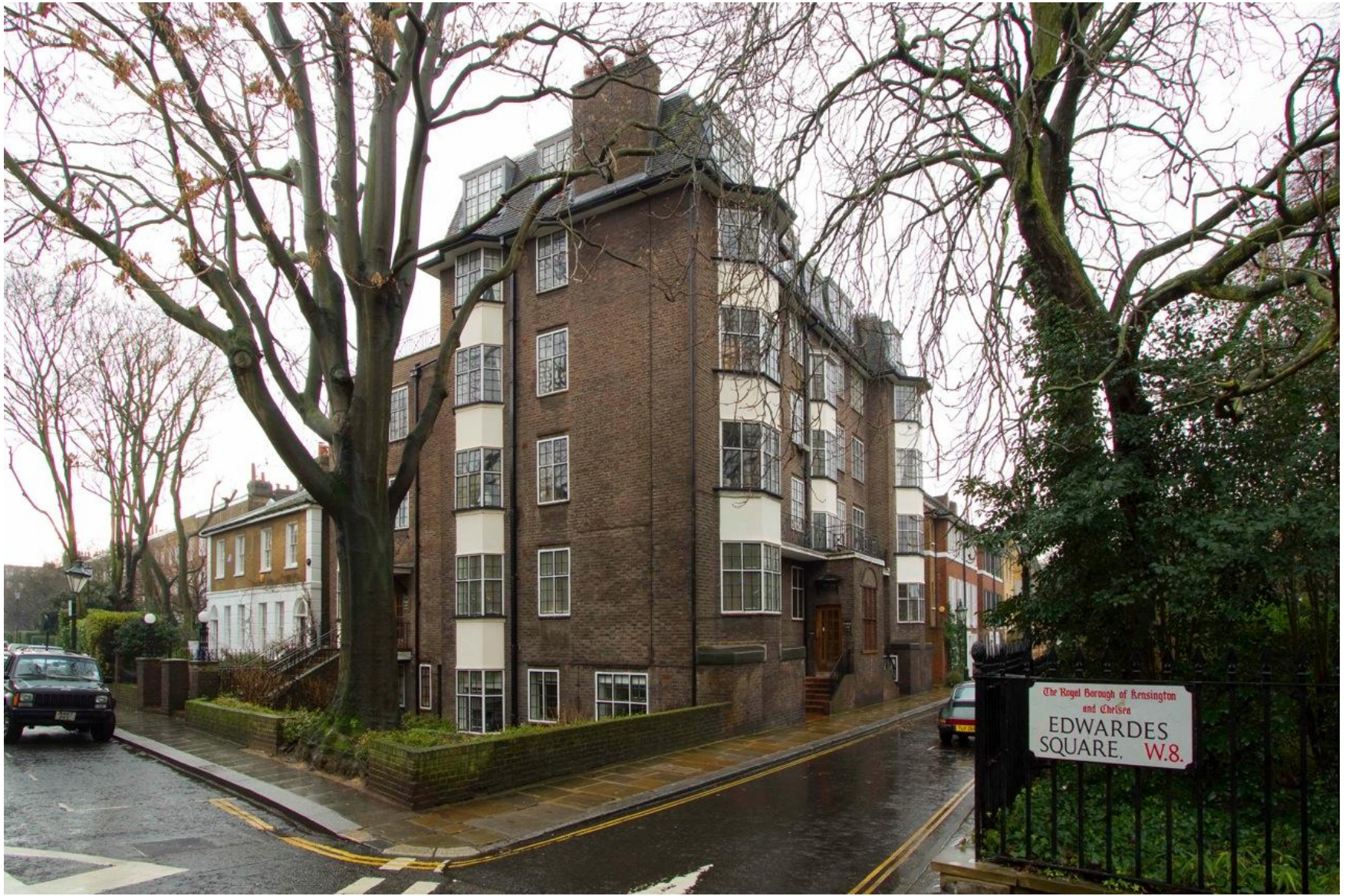
LCP House, Ogle Street, London W1W 6HU sales@lcpprivate.com 020 7723 1733