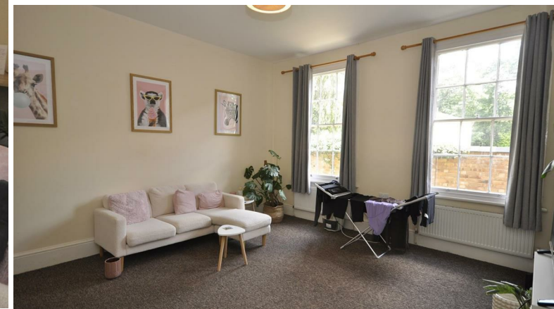
A spacious, ground floor garden Apartment, situated in a prestigious North Leamington location, with a small courtyard garden.