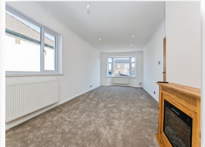
Black Bear Lane, Wisbech PE13 3SA