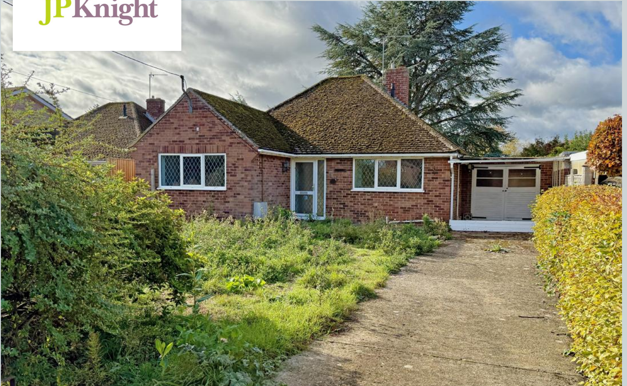
Mill Lane, Chalgrove OX44 7SL