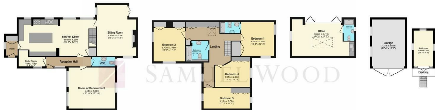
Ground Floor Floor area 108.7 sq.m. (1,170 sq.ft.)