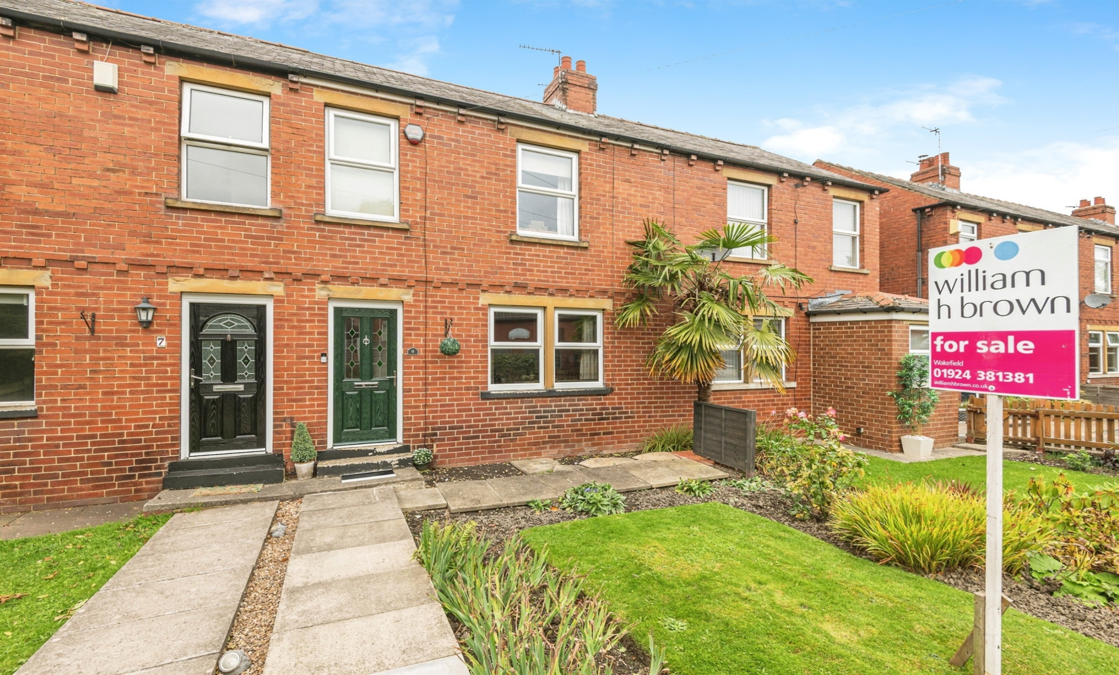
Clifton Terrace, Ossett WF5 8EQ