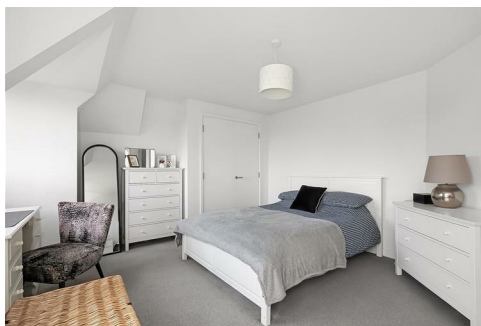
Purley Hill, CR8

Approximate Gross Internal Area 73.5 sq m / 791 sq ft