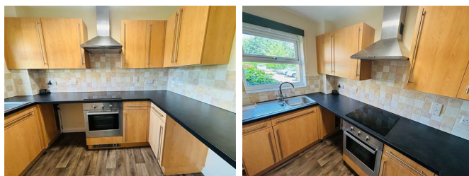
Double glazed window, a range of fitted wall, drawer & base units, work surfaces, electric hob with an extractor fan above, built under oven / grill, inset sink & drainer, plumbing for an automatic washing machine, ample space for a fridge / freezer