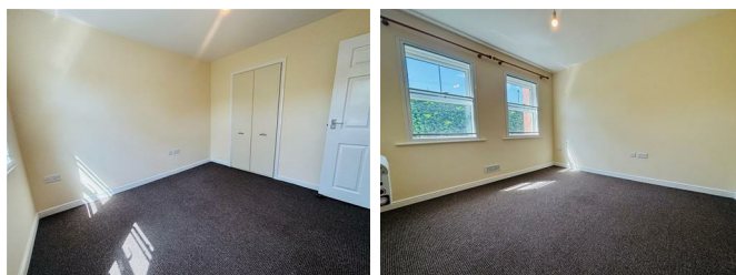
Triple glazed window, fitted wardrobes, wall mounted electric heating radiator