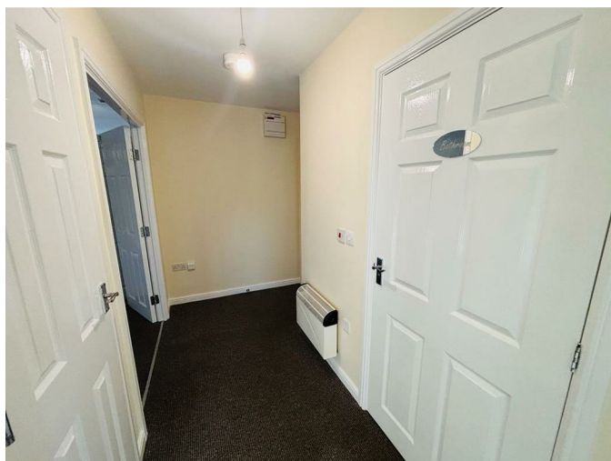
Access to the ground floor accommodation, wall mounted electric heater