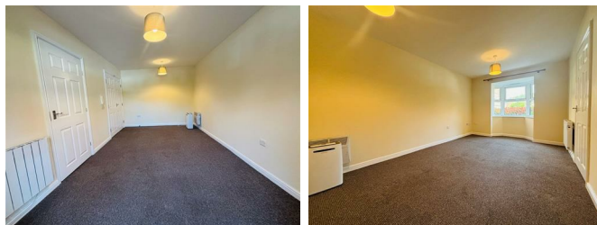
Double glazed window, double internal doors giving access to the hallway, two wall mounted electric heating radiator, ample space for a range of living & dining room furniture