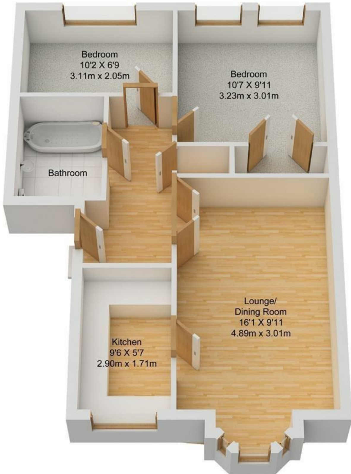
Ground Floor Approx. 50.0 Sqm. (538 Sqft.)