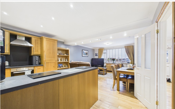
Living Room / Dining Kitchen