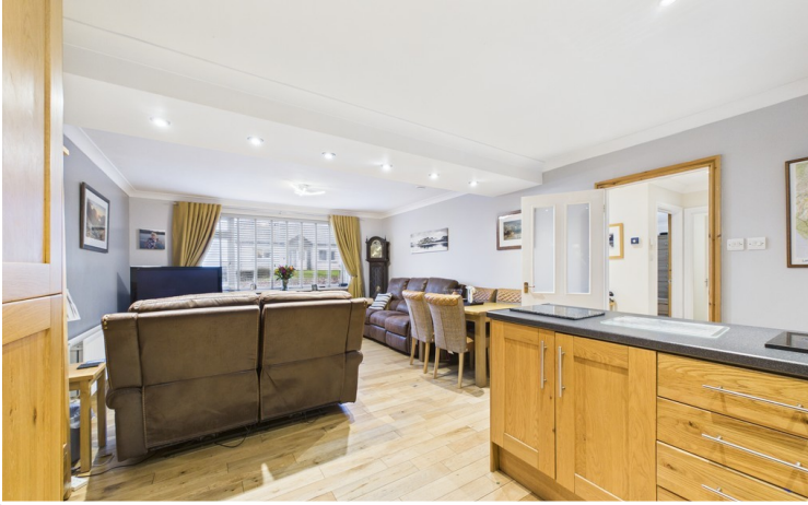
Living Room / Dining Kitchen