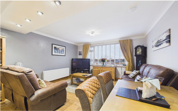
Living Room / Dining Kitchen