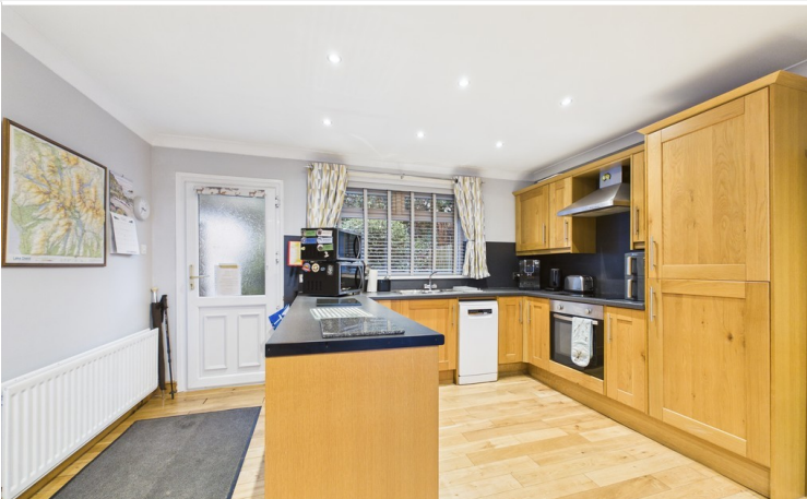
Living Room / Dining Kitchen