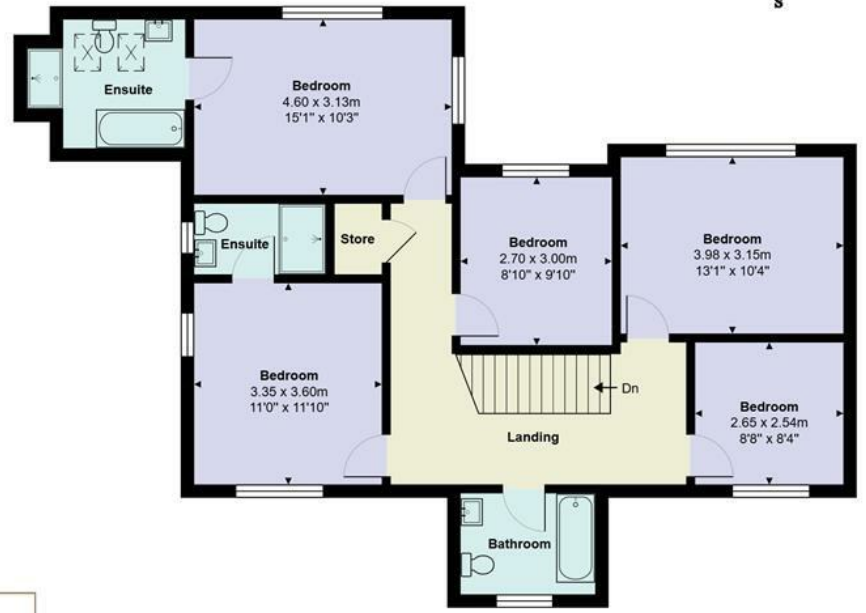
First Floor Area: 106.2 m 2 ... 1143 ft 2