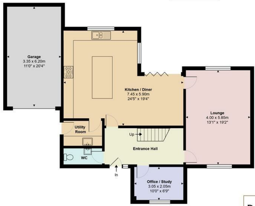
Ground Floor Area: 93.8 m 2 ... 1010 ft 2