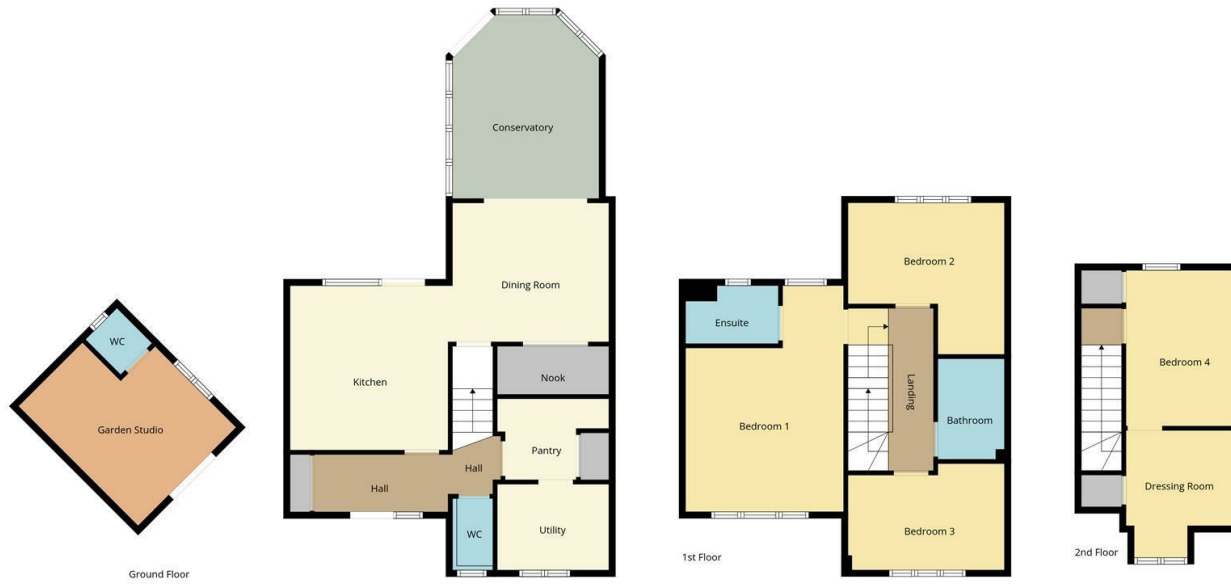
Floor Plan Created By Harper & Reid. Measurements Deemed Highly Reliable But Not Guaranteed