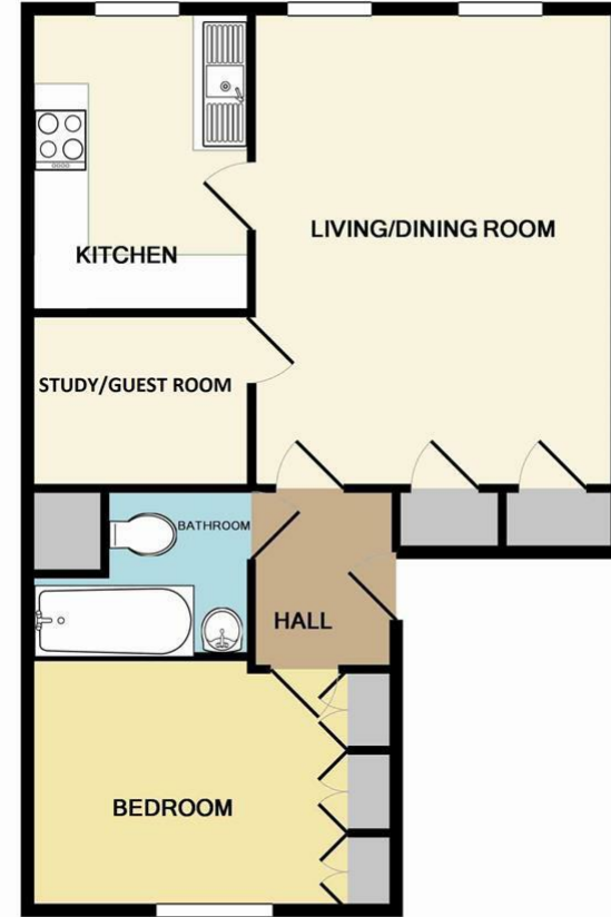
TOTAL APPROX. FLOOR AREA 602 SQ.FT. (55.9 SQ.M.)

Referral Fees- With a view to offer a smooth and comprehensive service we may at times recommend various associated services and companies. These include financial advisors and surveyors. You, the consumer are never under any obligation to use any of these services if you have preferences elsewhere. For these services we may receive referral fees from the service provider. Should you take up any of our surveyor referrals we may receive a fee as follows; from Tomblesons Surveyor's £15 voucher, Daniells Harrison Surveyors £50, Connells Surveyors £100.