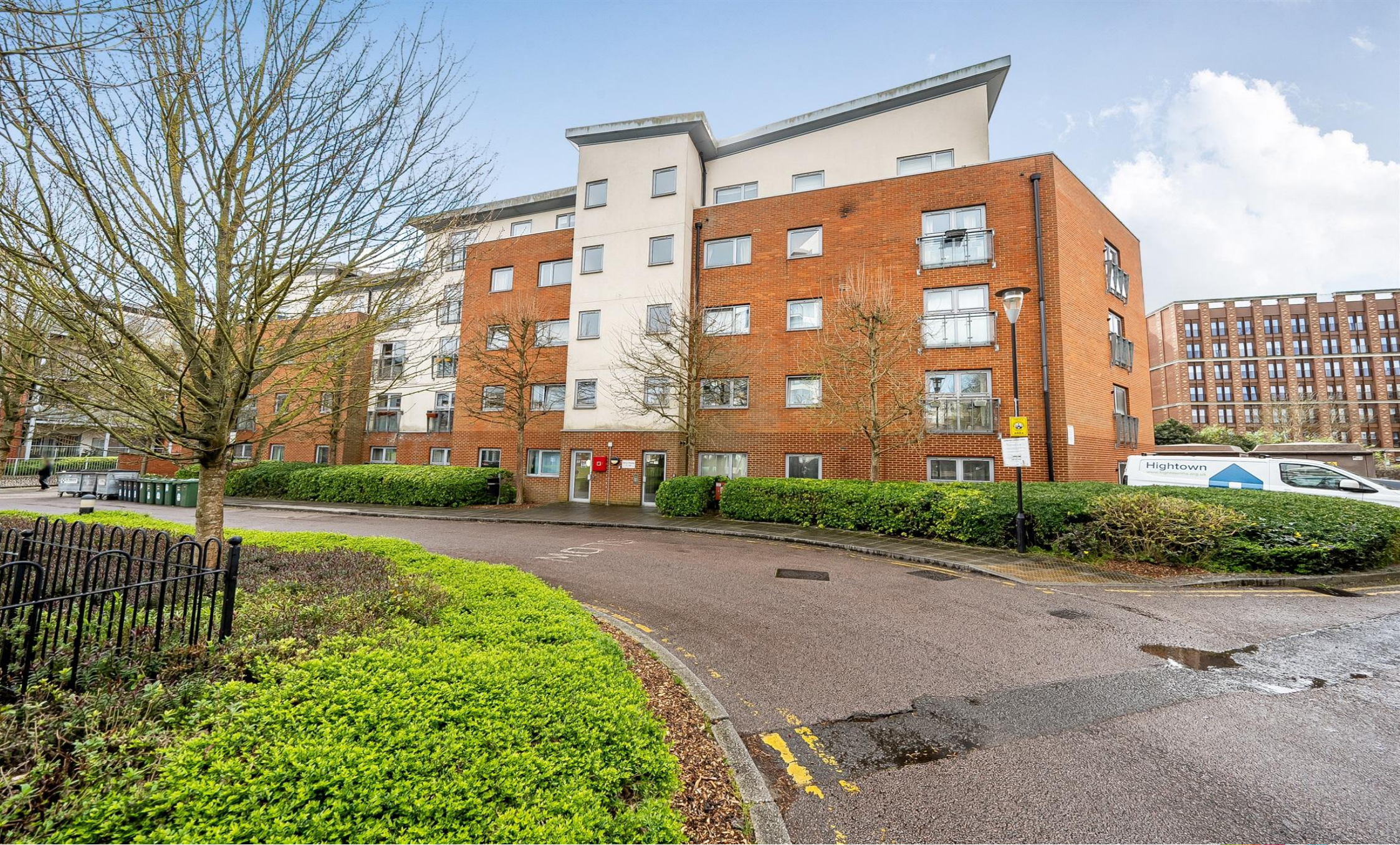
Davy House, Charrington Place, St. Albans, AL1 3FL