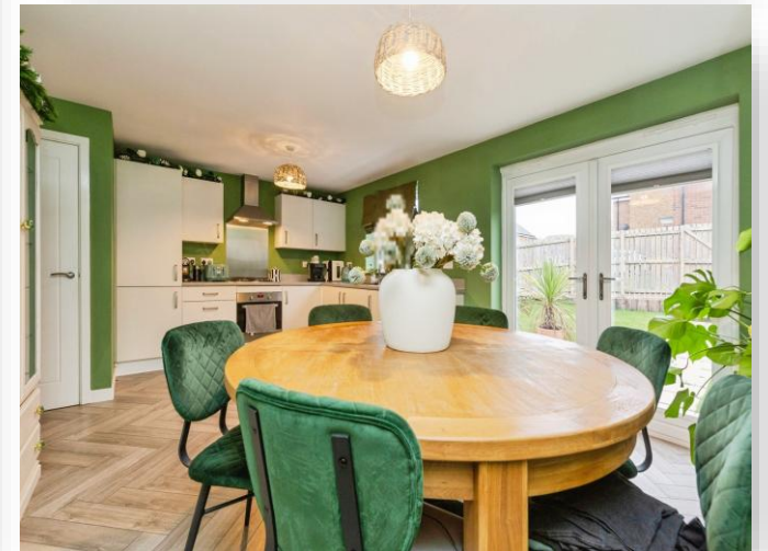
Aspen Gardens, Hartlepool, TS27 3DD