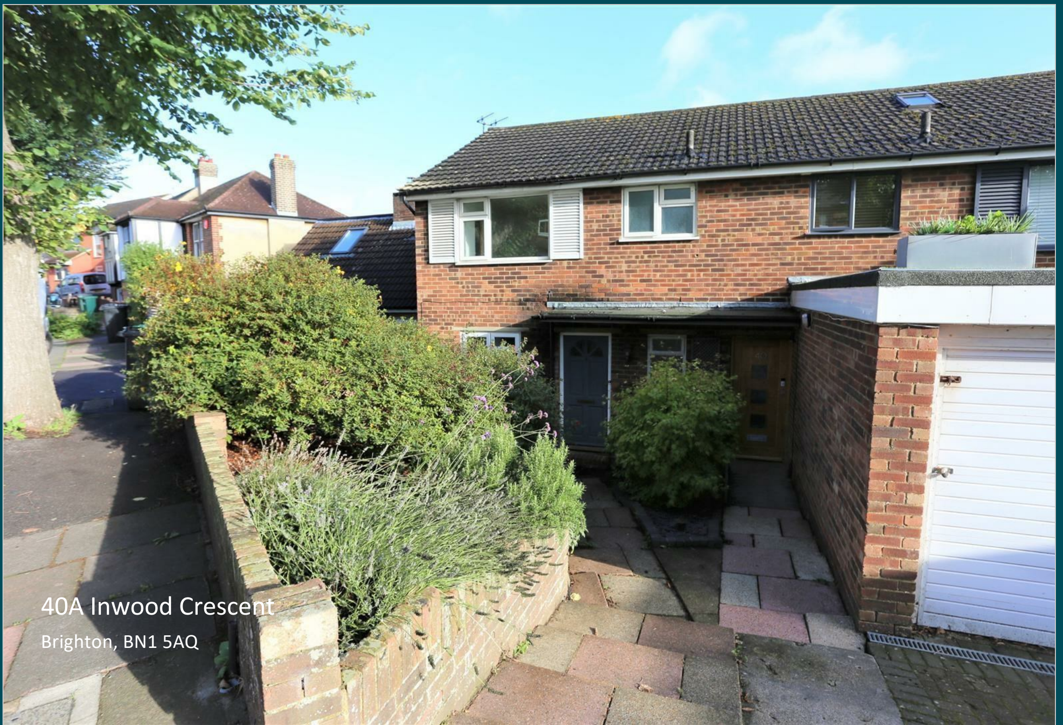
40A Inwood Crescent Brighton, BN1 5AQ