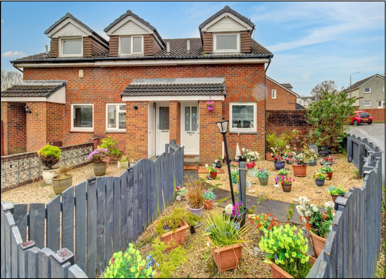
15 Hawthorn Way, Dumbarton, G82 5EB

The agents are delighted to present this well-presented one-bedroom end-terrace villa, located in a peaceful position within the popular Hawthornhill Estate to the east of Dumbarton.