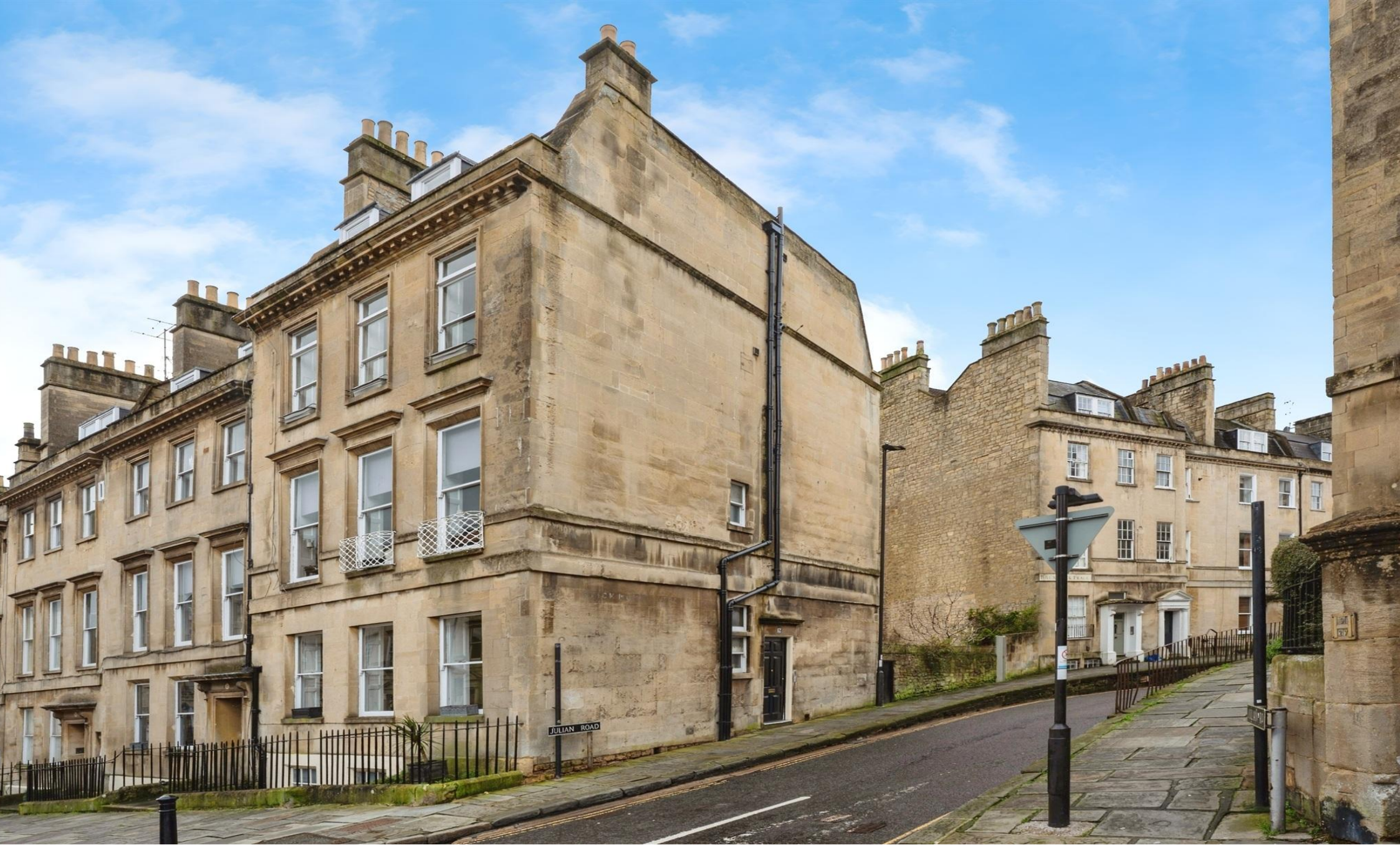
Flat 3 Oxford Row, Bath BA1 2QW