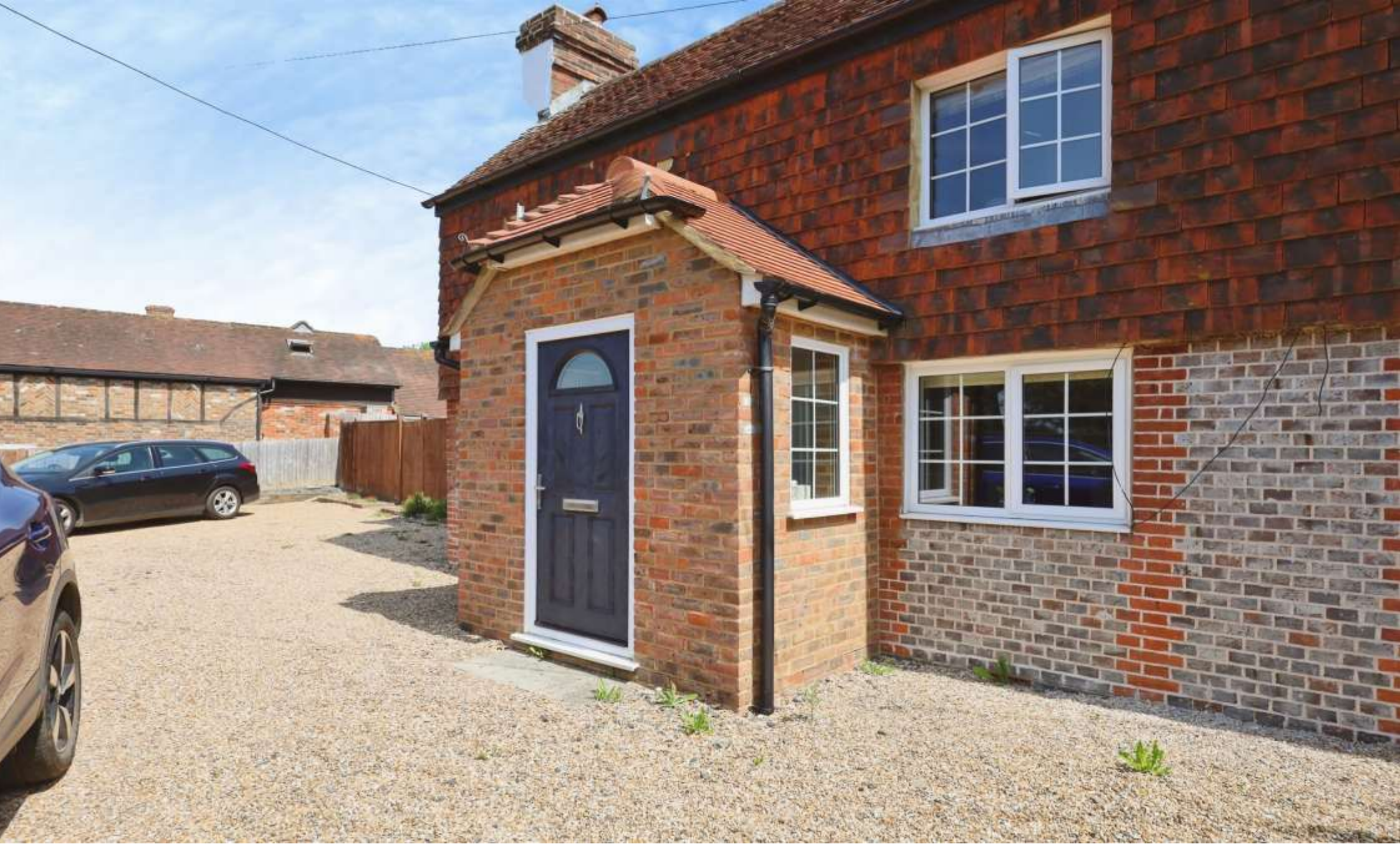
Watsons Cottage, Holmes Hill, Lewes BN8 6JA