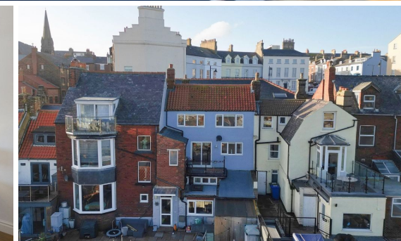
52 CLIFF STREET, WHITBY- 2 bed Cottage -£425,000