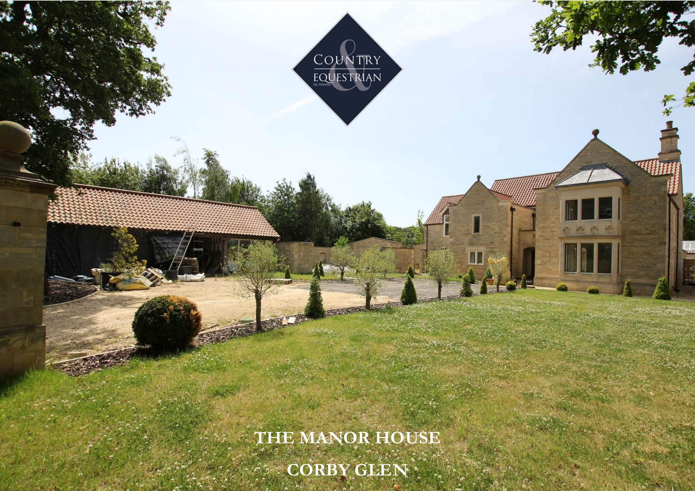
THE MANOR HOUSE CORBY GLEN