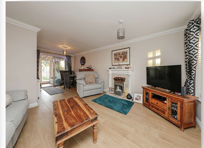
North Park, Fakenham, NR21 9RG