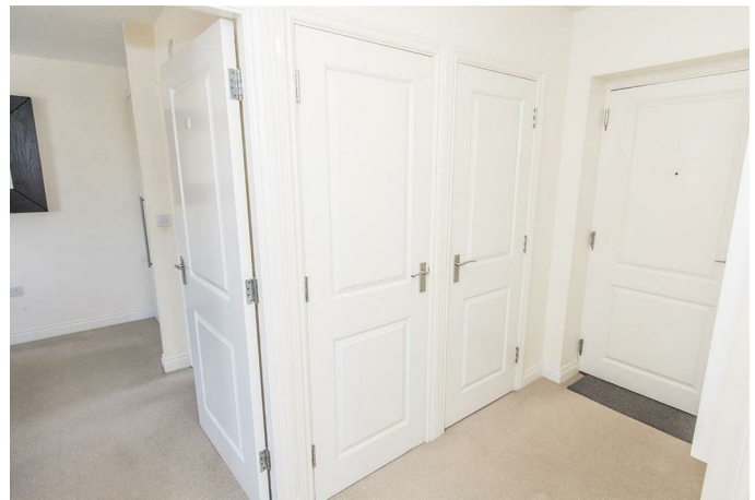
Living/Dining/Kitchen 18'4" x 11'3" (5.59m x 3.43m)

Private main front entrance door. Two built in storage cupboards. Radiator.