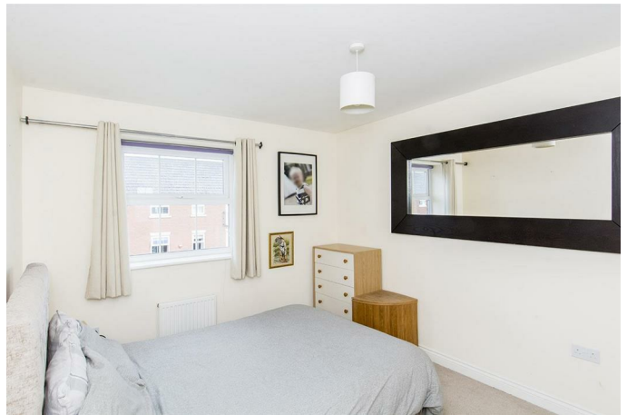
UPVC double-glazed window to front. Fitted wardrobes. Radiator. Door through to: