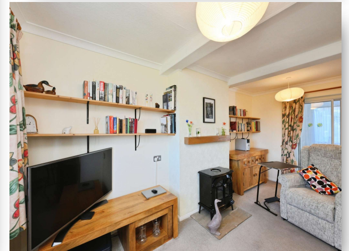
Windmill Way, MUCH HADHAM SG10 6BH