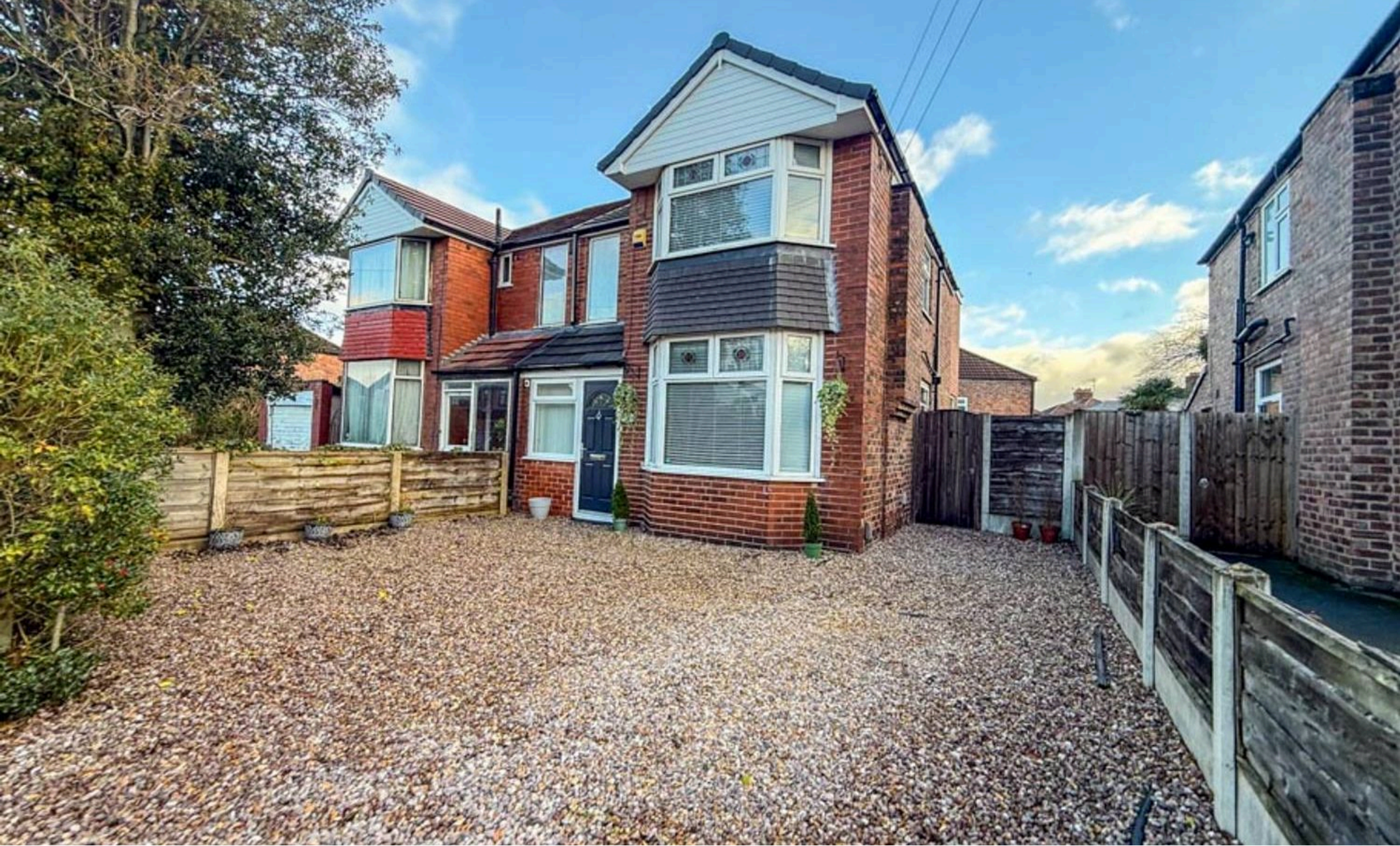
23 Brook Avenue, Timperley £500,000