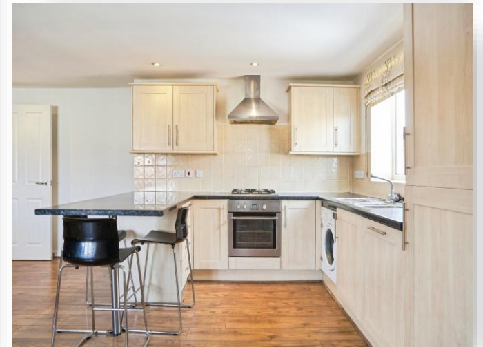
9 Westgate House Owlcotes Road, Pudsey LS28 7LQ