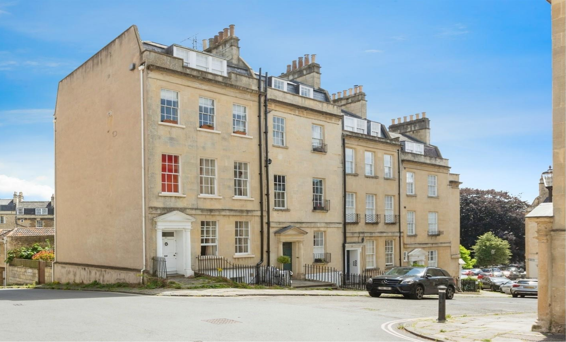
Park Street, Bath BA1 2TD