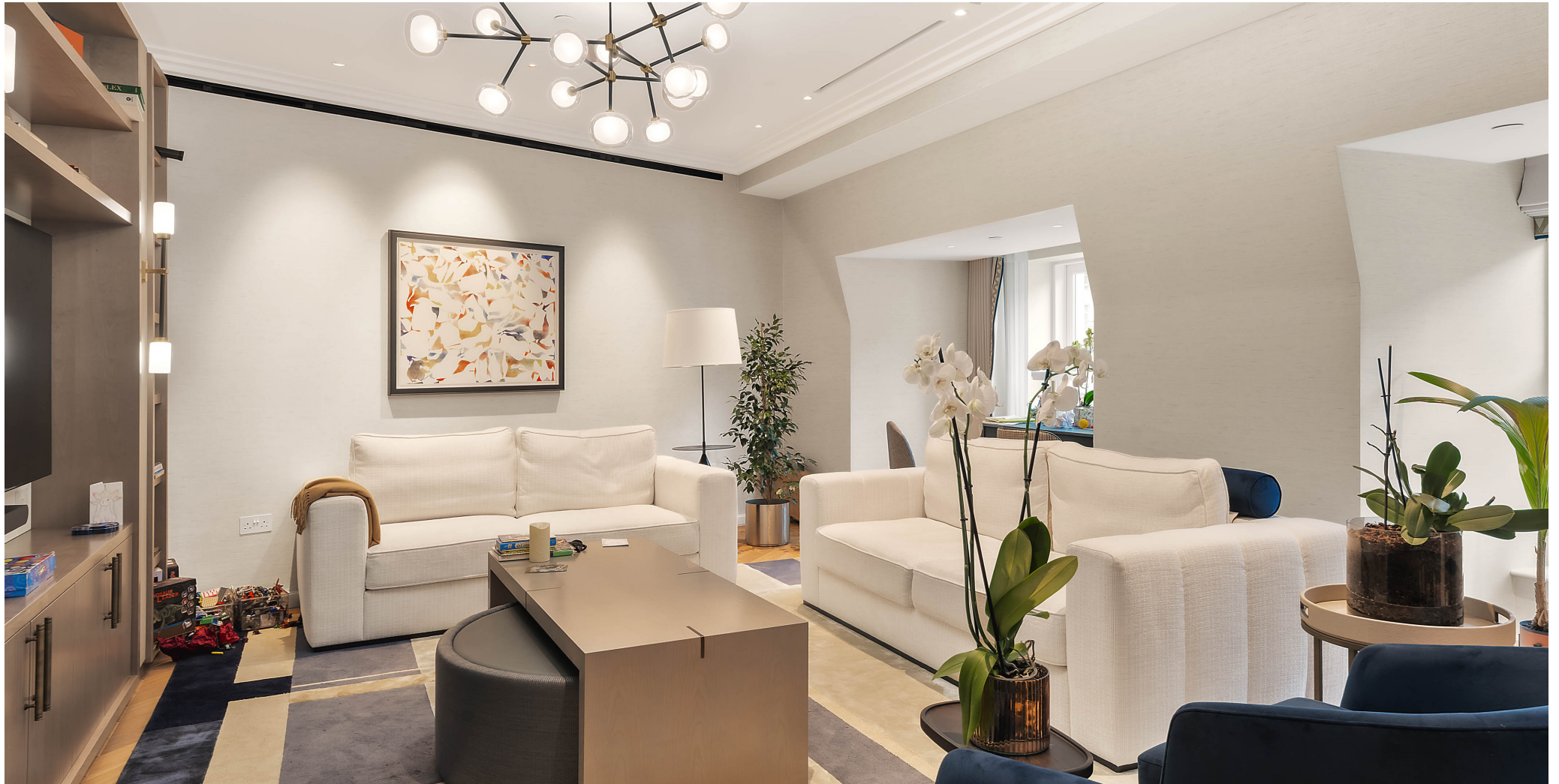
BASIL STREET, Knightsbridge SW3