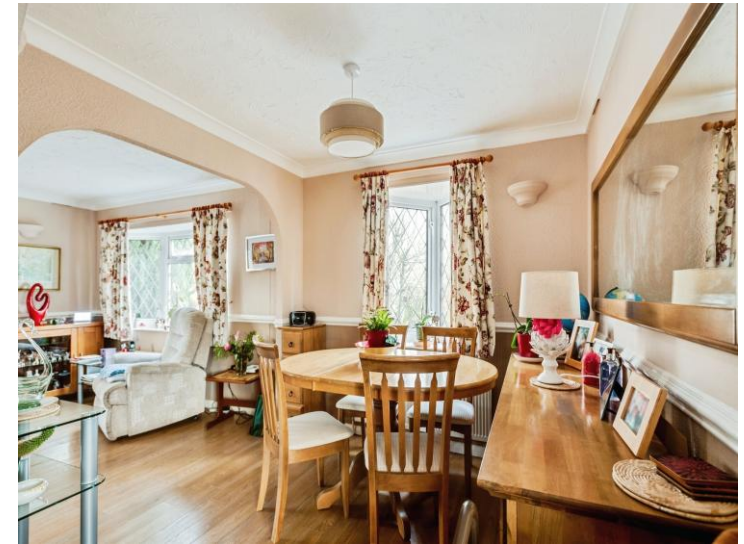
Pebble Hill, Radley, Abingdon, OX14 2JX