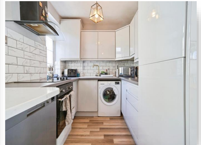
Rylands Avenue, Gilstead Bingley BD16 3NJ