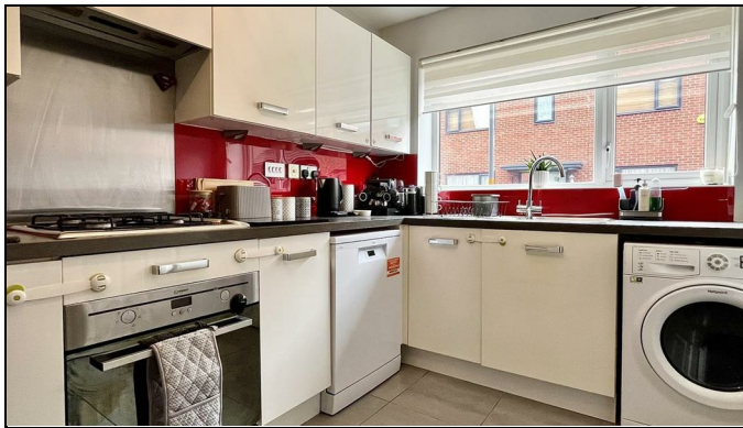
Hollifast Lane, B24 0JE