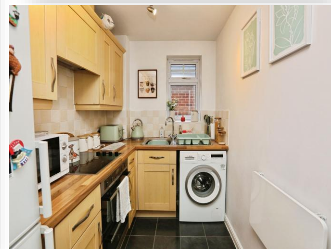
Benny Hill Close, Eastleigh. SO50 5GG