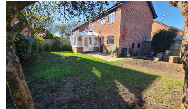
Trusted. Award Winning. Experts.

All measurements are approximate and for guidance only. Floorplans are not to scale and should not be relied upon as exact representations. Fixtures, fittings, and services have not been tested. Purchasers must verify the accuracy of all information and satisfy themselves before proceeding. Hamwic Independent Estate Agents Ltd accepts no liability for errors or omissions.