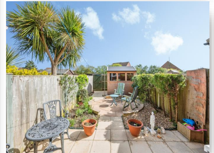
Nelson Way, Mundesley Norwich NR11 8JD