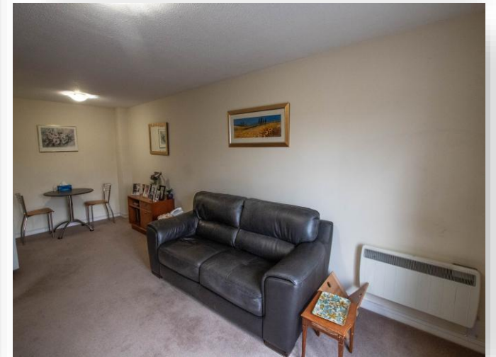
Brooklyn Court, Cherry Hinton Road, Cambridge, CB1 7HF