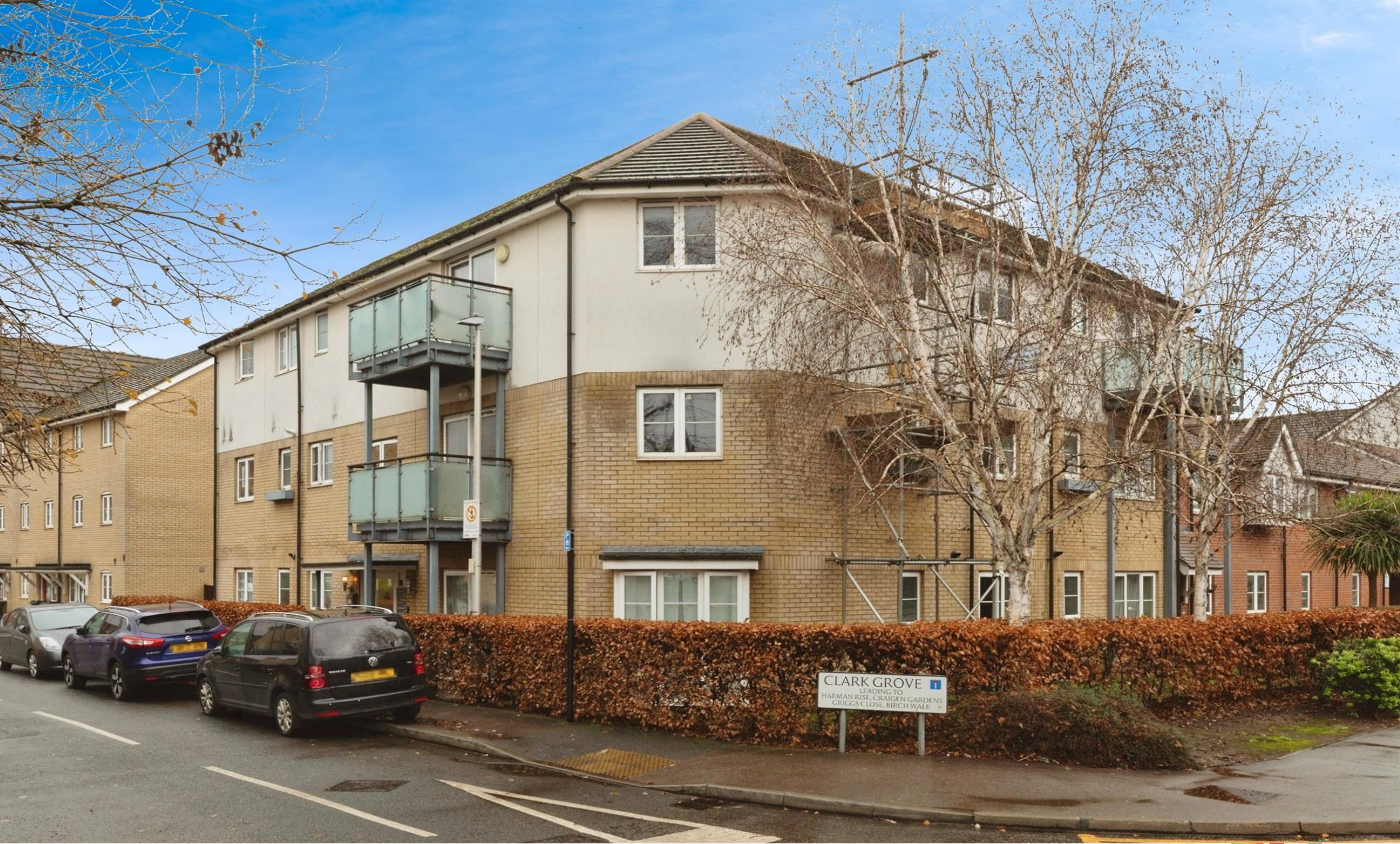
Clark Grove, Ilford, IG3 9FD