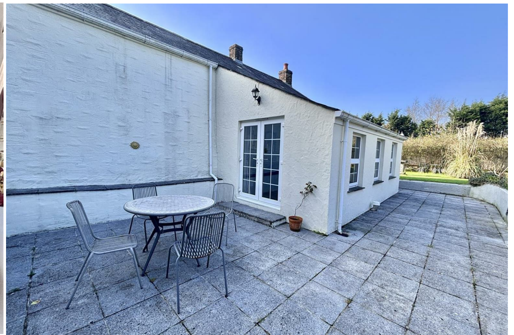
St. Stephen, St. Austell, PL26 7LF