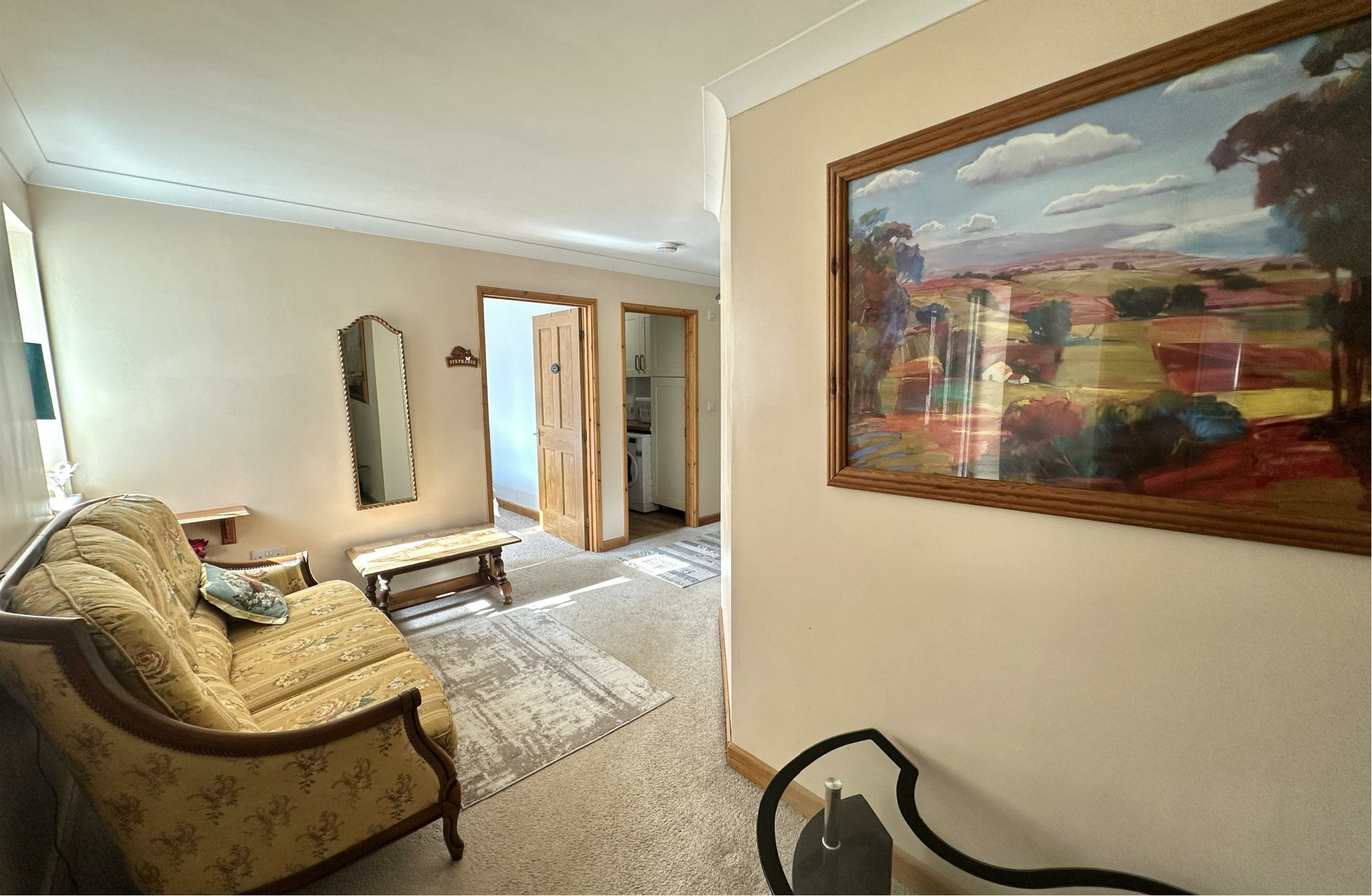
Tye Hill Close, Trewoon, St. Austell, PL25 5SG