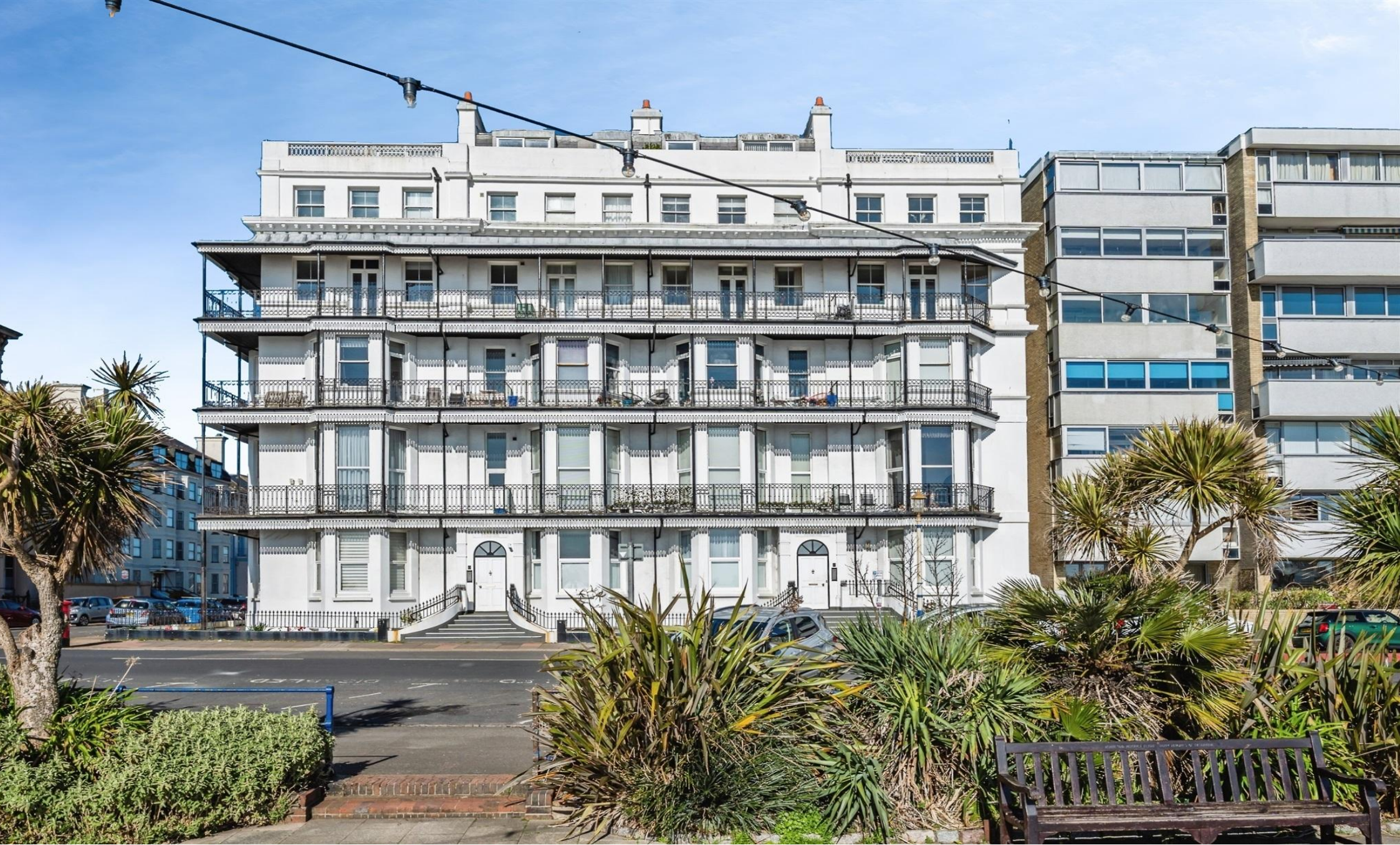
Sovereign House Grand Parade, Eastbourne BN21 3YP