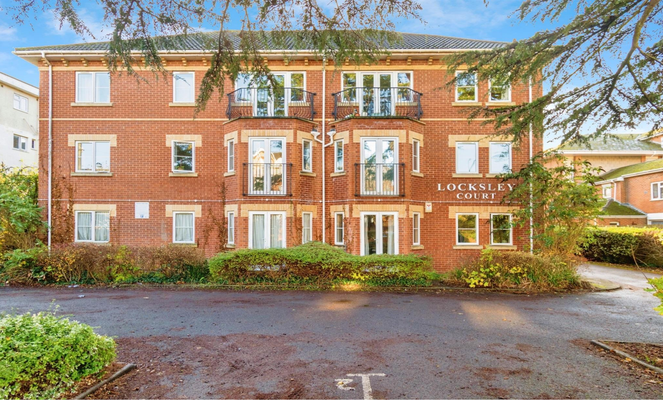
Locksley Court, Archers Road, SOUTHAMPTON SO15 2LE