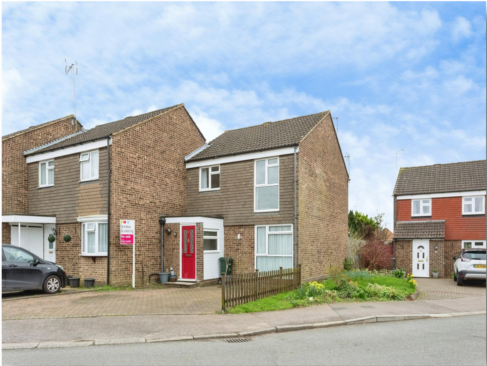
Silk Mill Road, Watford, WD19 4JW