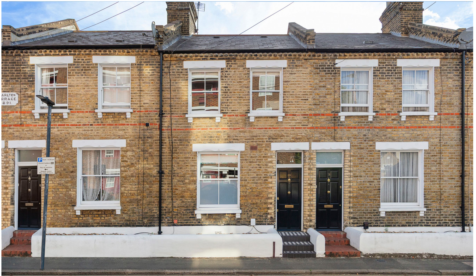
Eastney Street, Greenwich, London, SE10 9NR