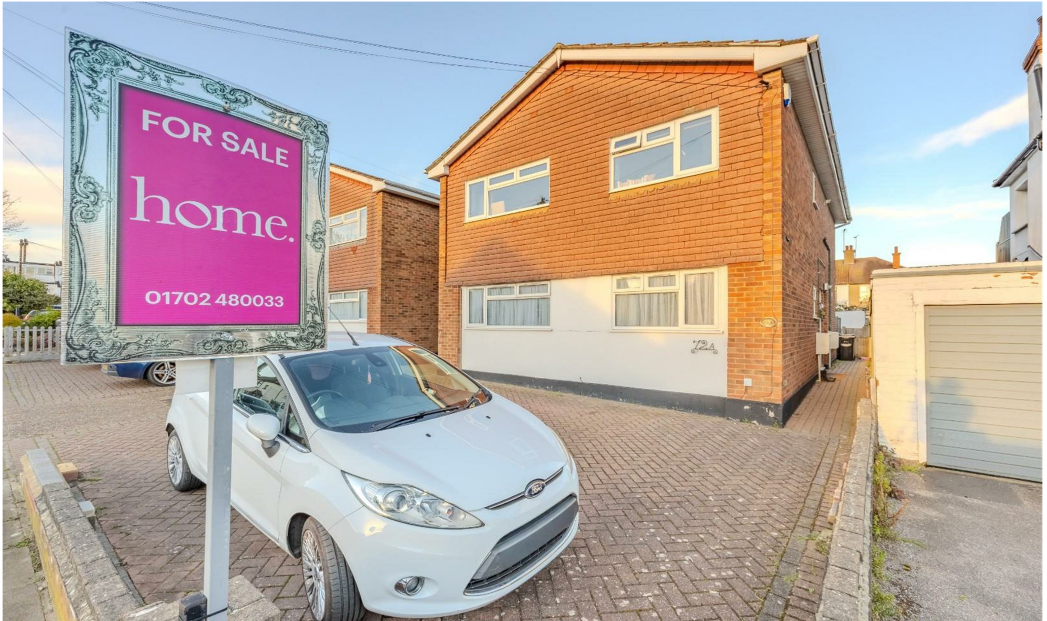
Canvey Road, Leigh-On-Sea £340,000