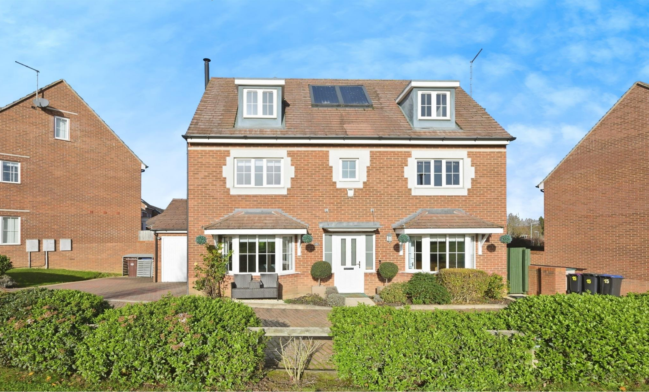
Gatekeepers Way, Watton At Stone Hertford SG14 3QB