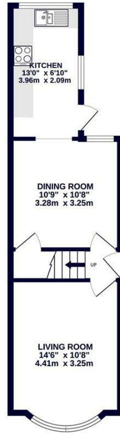
GROUND FLOOR 382 sq.ft. (35.5 sq.m.) approx.