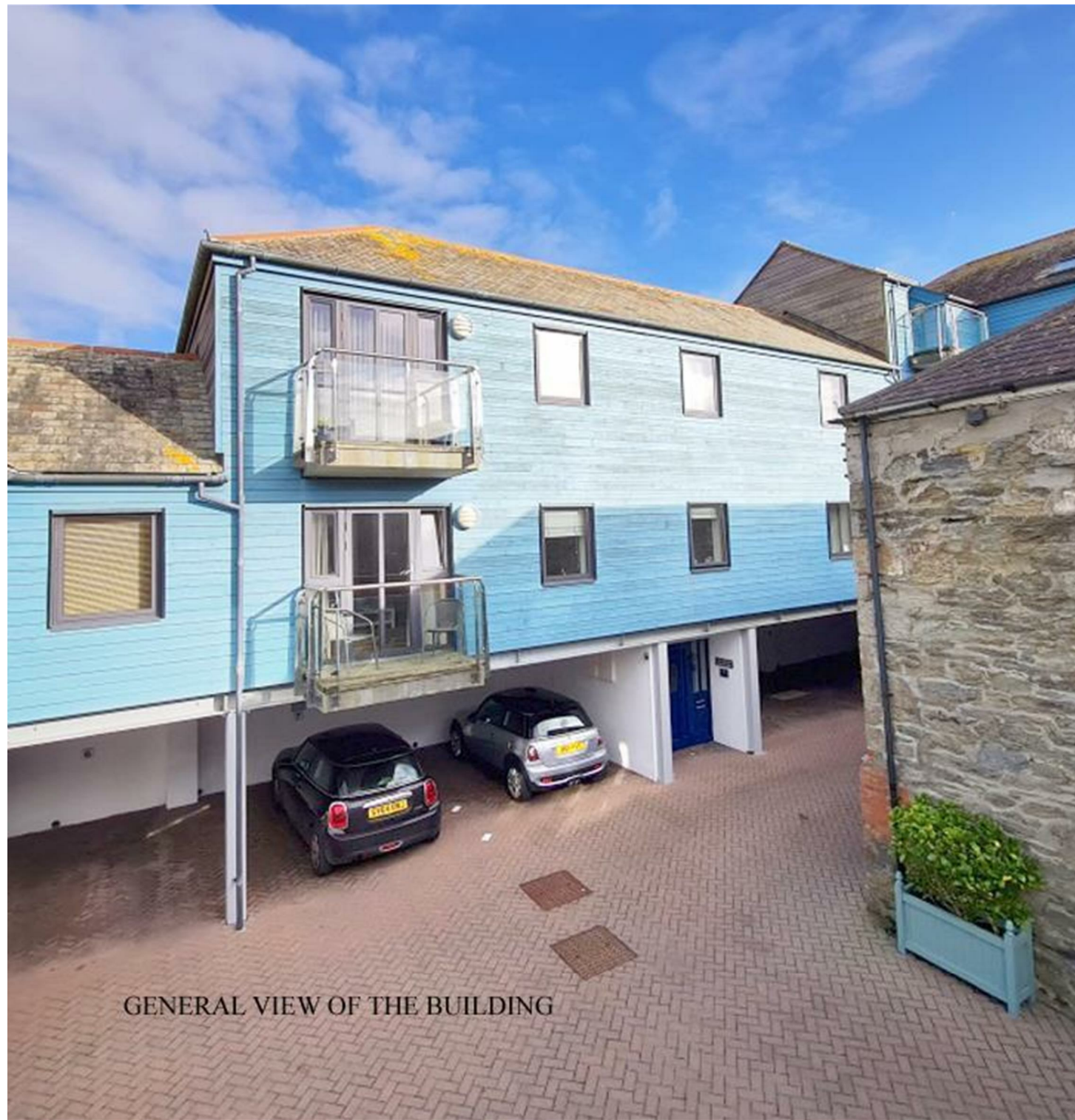
GENERAL VIEW OF THE BUILDING

Porthleven is a thriving seaside Cornish fishing village with its large harbour providing a focal point around which cluster many public houses, restaurants and businesses. The village provides amenities to cater for everyday needs as well as a primary school, whilst the more comprehensive amenities of Helston are a few miles distant with national stores, cinema and sports centre with indoor swimming pool. Situated between Helston and Porthleven is the beautiful Penrose Estate which is managed by the National Trust and where one may delight in many walks through the Cornish countryside and around Loe Pool which is Cornwall's largest natural freshwater lake.