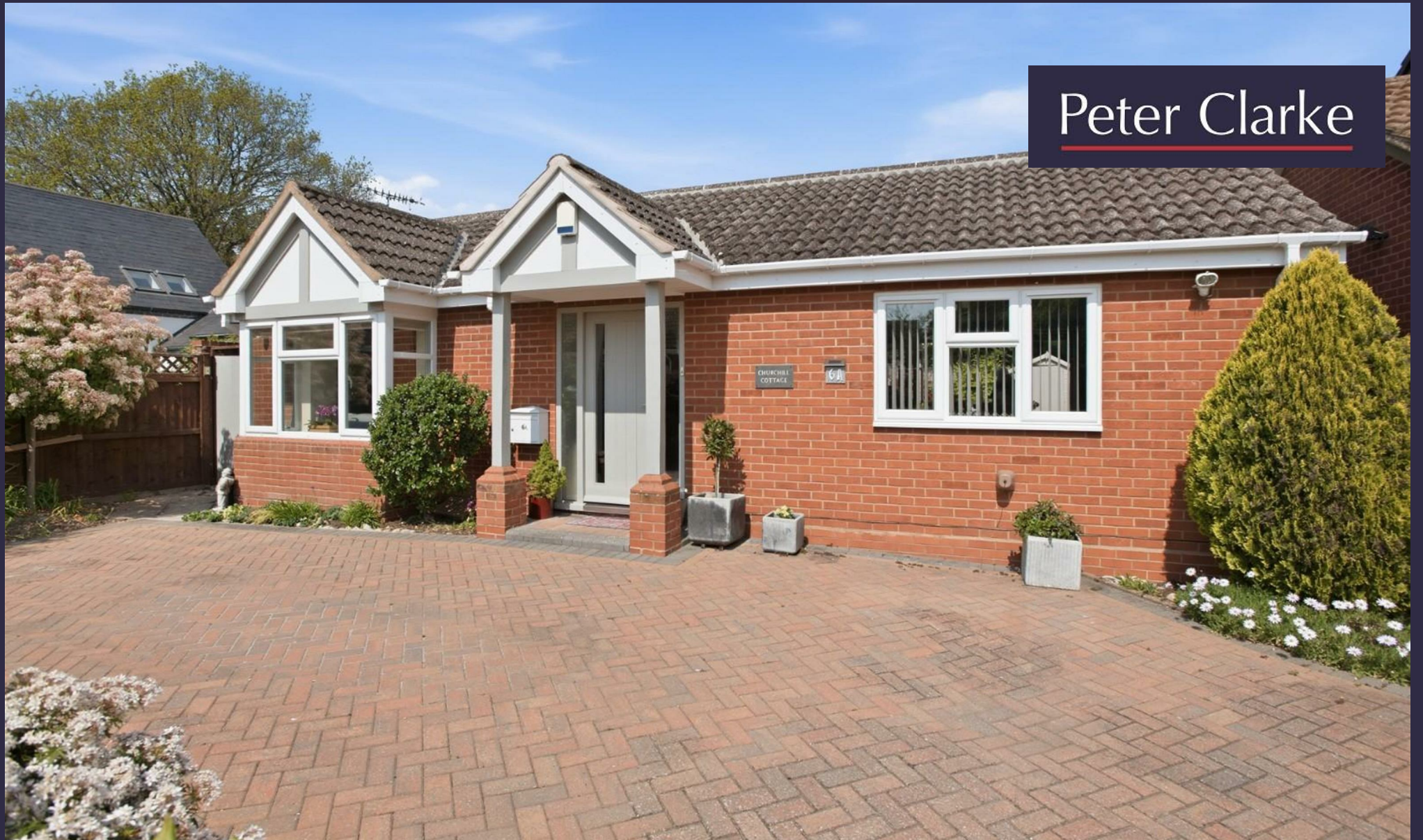
Churchill Cottage, 6A Winston Close, Shotton, Stratford-upon-Avon, CV37 9ER